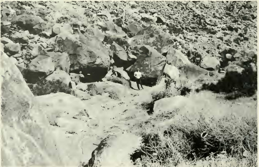
Figure 3. Nelson Mountains, Grapevine Canyon. Elevation 5000 feet. Station 13. March 1959. Four buried can "pitfall" traps were located on a line on the left side at the base of large basalt boulders. An adult male of Gerrhonotus panamintinus was found dead in a buried-can trap on May 7, 1960.

STATION 16. (Figure 5.) Elevation 4850 feet. The environment at this station was similar to that described by Stebbins (1958, pp. 11-12) for the type locality of G. panamintinus in Surprise Canyon. Salix laevigata , S. lasiolepis , Clematis lugusticifolis , and Vitis Girdiana were the dominant tree and shrub cover, affording a relatively lush situation in comparison to the surrounding hillsides. Reptiles collected included Sceloporus occidentalis longipes